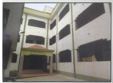
Bhagabati Devi Hostel