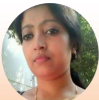
Dr. Nabanta Datta Nistarini College, Purulia, West Bengal