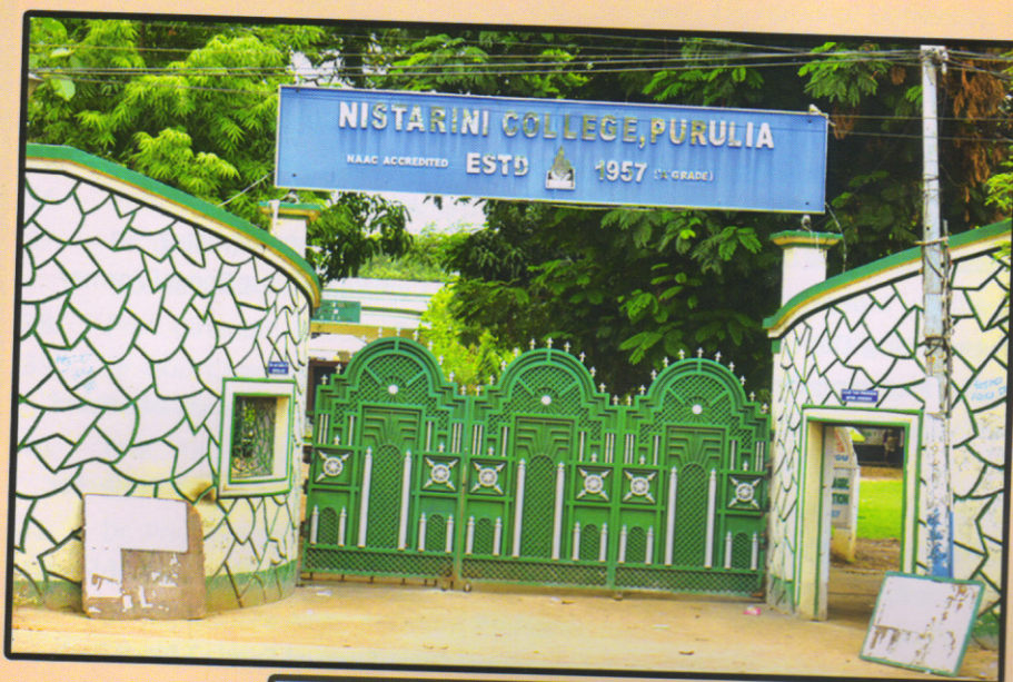
Through the Entrance ...