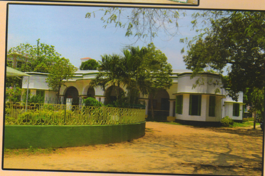
Into the Pristine Campus