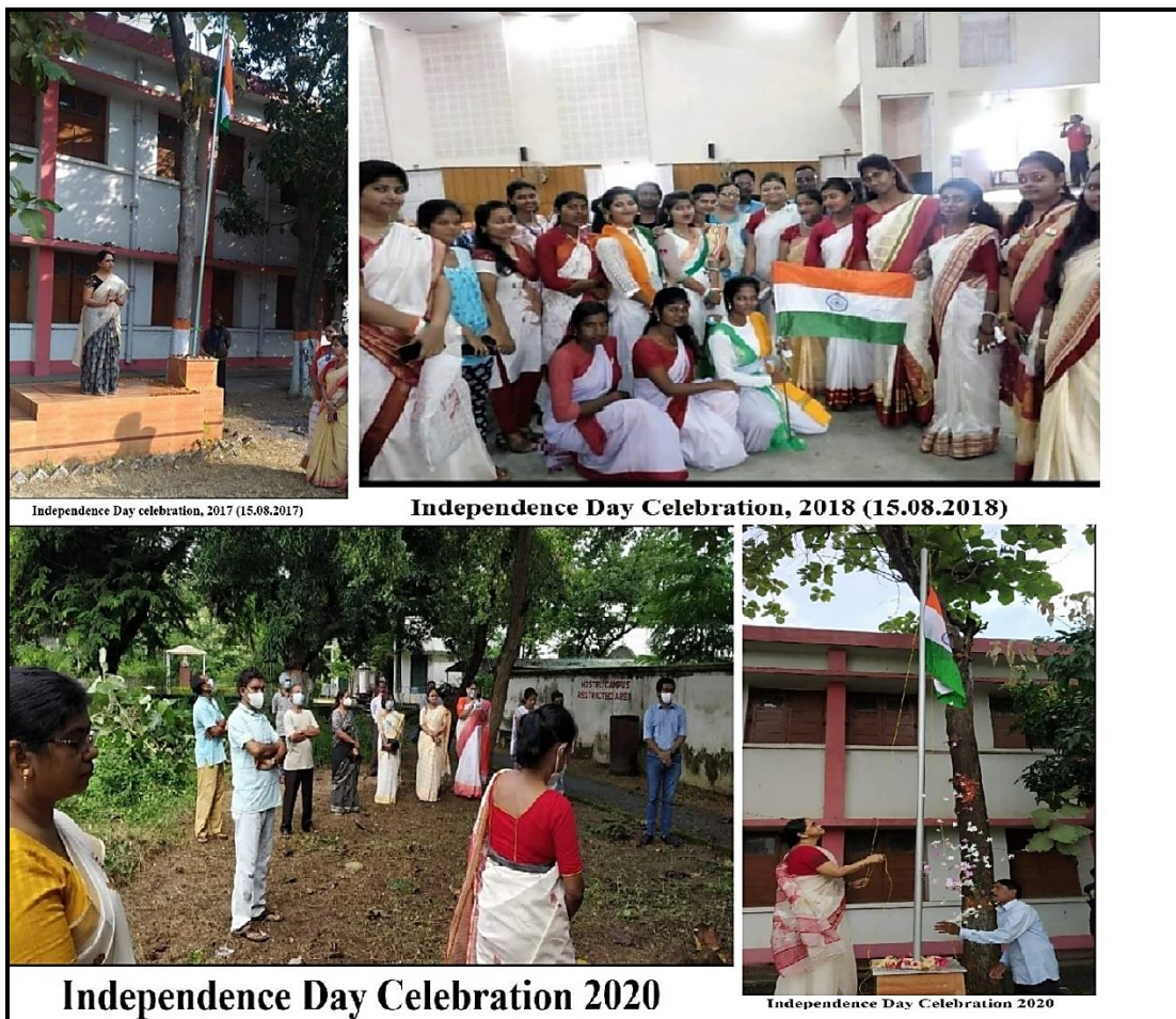
Celebration of Independence Day in our campus

1. Independence Day : As an institution that nurtures patriotic values, Nistarini College actively participates in the celebrations of Independence Day. Every year, the Independence Day is celebrated on the 15 th of August morning. All faculty members, non-teaching staff and a good deal of students gather at the college premises for the flag hoisting ceremony early in the morning of this day. After the flag hoisting and a speech by the Honourable Principal, a short cultural program, based on patriotic theme, is presented by the students of the college.