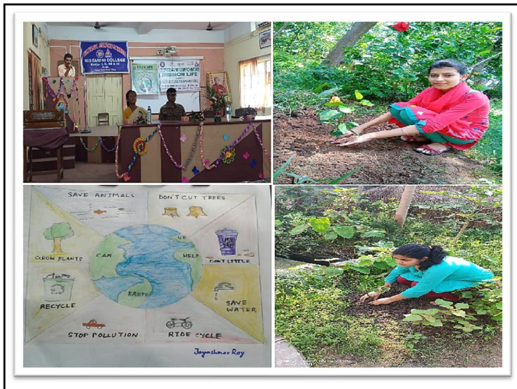
Celebration of World Environment Day

organized in collaboration with the Presidency Thinkers' Club, Kolkata, and the World Social Forum, Italy.