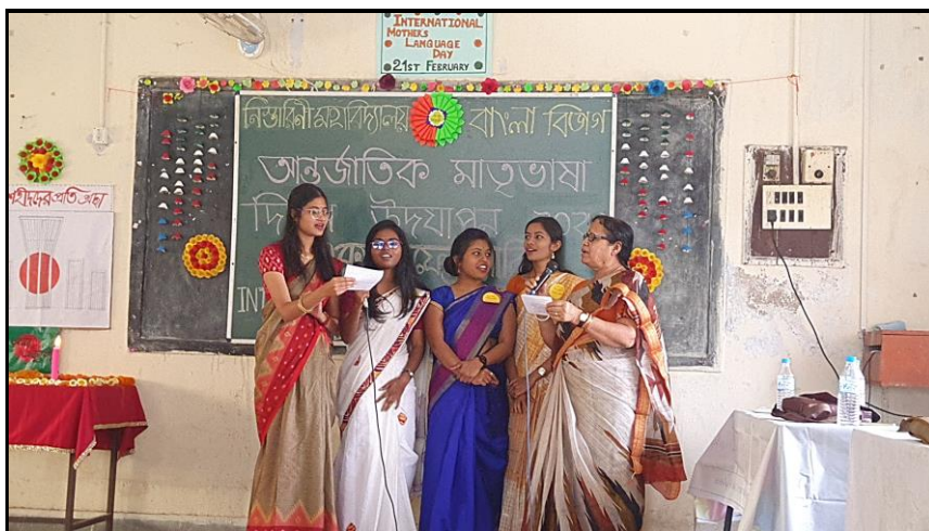
Celebration of International Mother Language Day

4. International Mother Language Day (Bhasa Divas) : Every year the International Mother Language Day is celebrated on 21 st February, under the leadership of the Post Graduate Department of Bengali. The importance of the Mother Language is emphasized on this day. Songs in the mother tongues of the students are sung, and sometimes rallies are brought out early in the morning on this occasion.