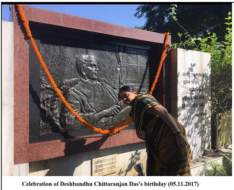
Celebration of Deshbandhu Chittaranjan Das's birthday (05.11.2017)

11. Deshbandhu Chittaranjan Das's Birthday : The college celebrates the birthday of Deshbandhu Chittaranjan Das who played an integral role in the establishment of Nistarini College on 5 th November every year. On this day, students and faculty gather at the college campus to pay tribute to Deshbandhu Chittaranjan Das by garlanding the statues in the campus.