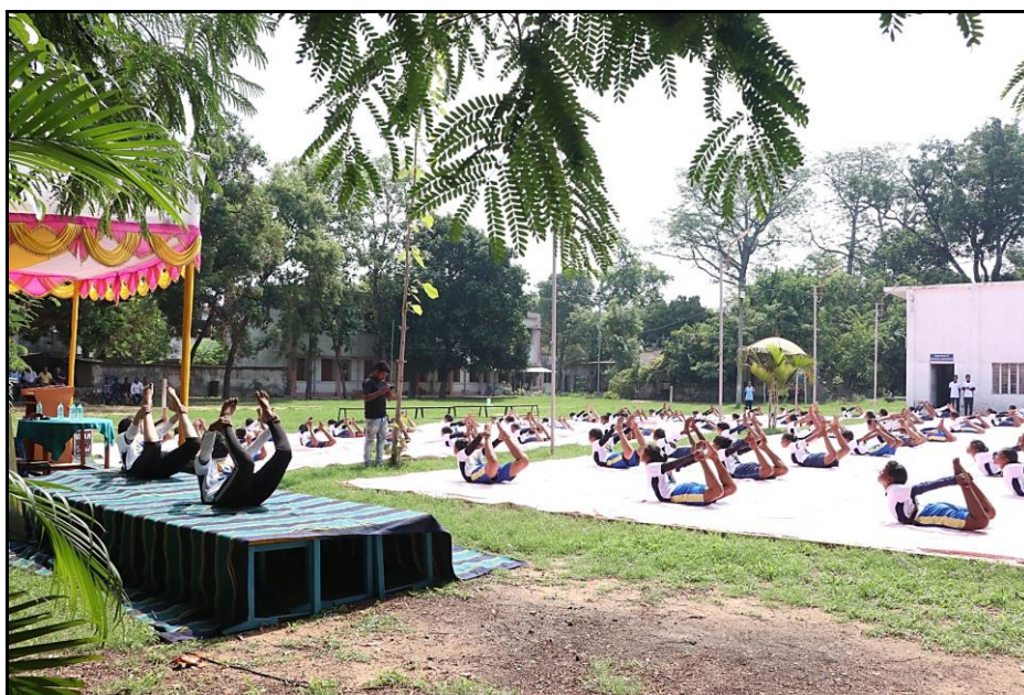
Celebration of World Yoga Day

8. World Yoga Day : This is an event which is very successfully celebrated every year on 21 st June. The Physical Education Department takes the lead in this regard, and it is a wonderful sight to watch 200 girls performing yoga together early in the morning on the college ground. On certain occasions, Meditation camps are also held on this day.